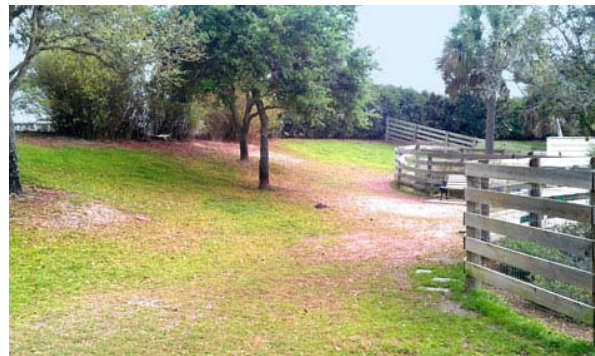
Brinson-Perry Dog Park