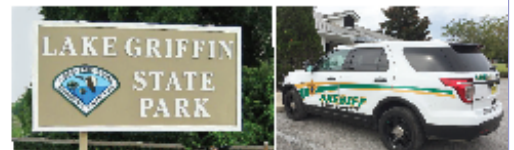
WORKING TO SERVE YOUR HOMETOWN