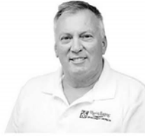
BILL ELLIOTT COLUMNIST

If you will be away from your Villages home for seven days or more, you can arrange for a Community Watch patrol driver to check your home three times during the week at different times of the day.