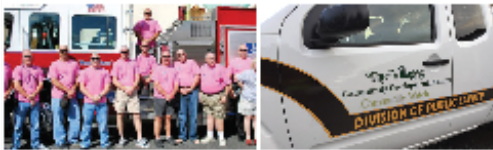
YOUR LOCAL GOVERNMENTS IN ACTION

The Villages® Community Development Districts