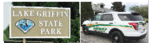
WORKING TO SERVE YOUR HOMETOWN