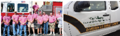
YOUR LOCAL GOVERNMENTS IN ACTION

The Villages® Community Development Districts