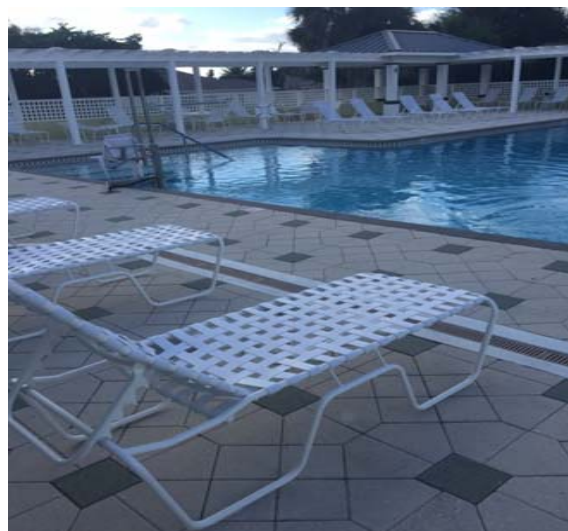
Calumet Grove Neighborhood Recreation Center