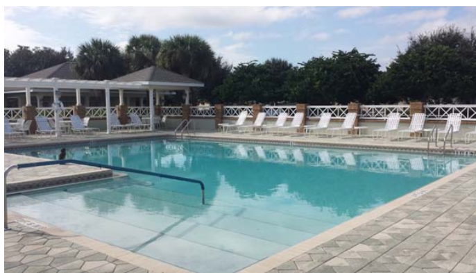
Bonnybrook Neighborhood Recreation Center

Ashland, Bonnybrook, Calumet Grove and Summerhill Neighborhood Recreation Centers have all new pool furniture ready to enjoy. Its winter, but here in Florida residents and their guests can relax and enjoy pool facilities all year around.