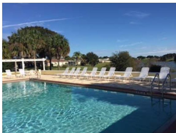
Summerhill Neighborhood Recreation Center