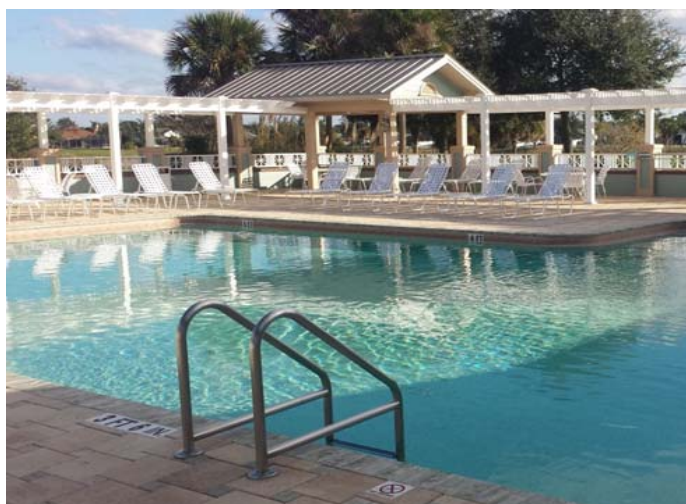
Ashland Neighborhood Recreation Center