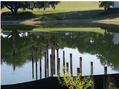
The old pilings were left to promote a wildlife habitat.

The pavilion framing is now complete and the cosmetic portion of the railing system is underway. The project is on schedule to be complete August 2016.