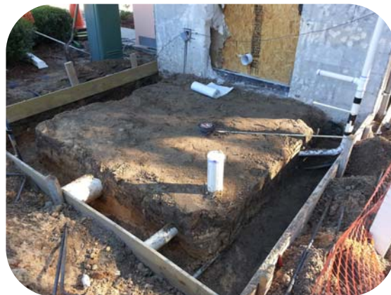
Del Mar Gate