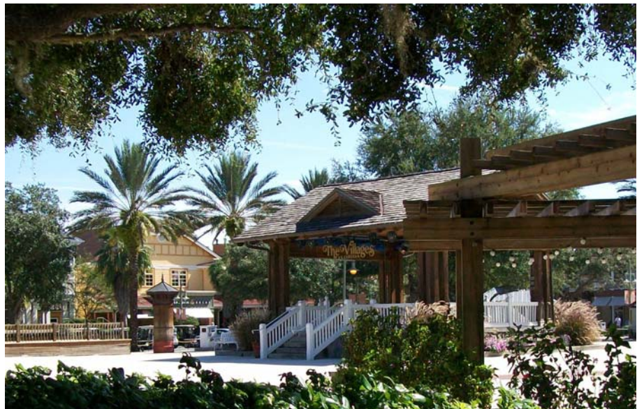
Lake Sumter Landing