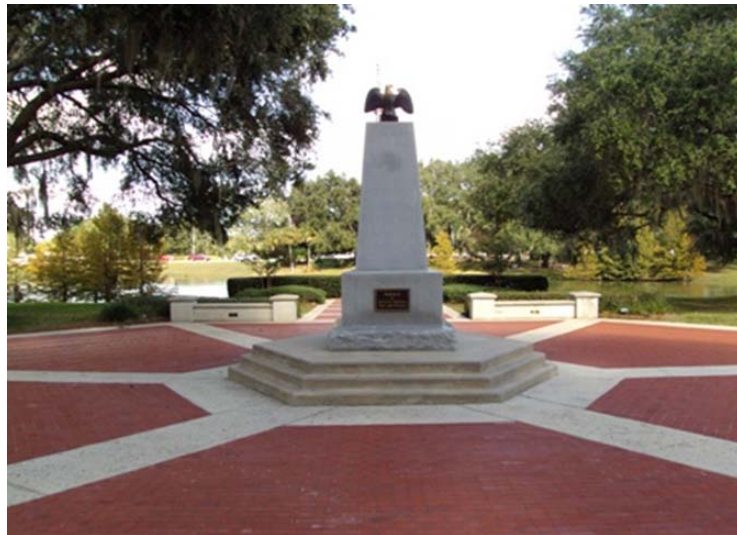
Veterans Memorial Park