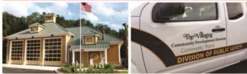
YOUR LOCAL GOVERNMENTS IN ACTION

The Villages® Community Development Districts