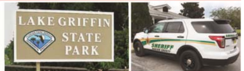
WORKING TO SERVE YOUR HOMETOWN

The Villages® Community Development Districts