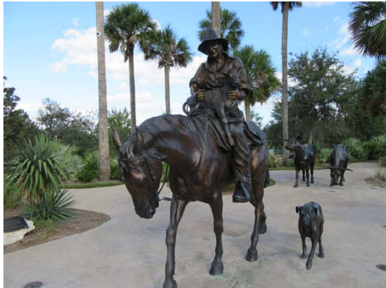
Brownwood Paddock Square