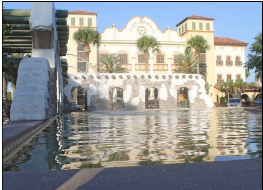
Spanish Springs Town Square