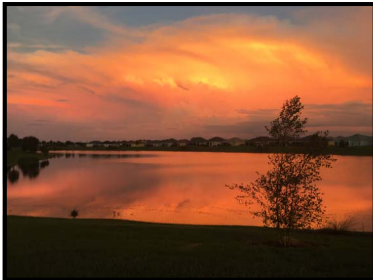
Anna Maria Avenue