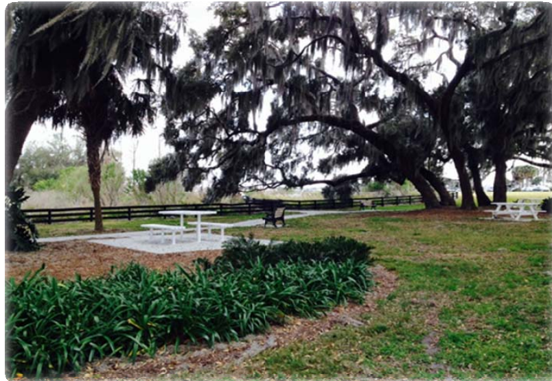
Live Oaks Park