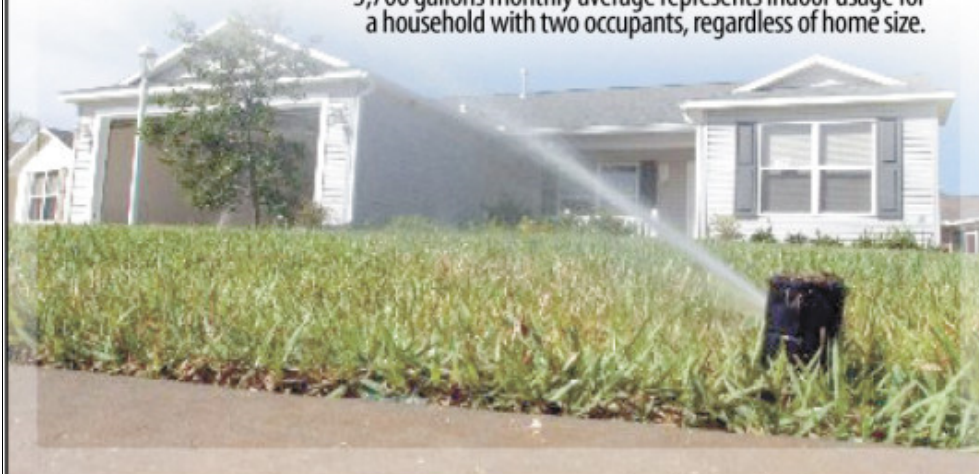
Graphic by Mike Orton / Daily Sun

* 3,700 gallons monthly average represents indoor usage for a household with two occupants, regardless of home size.