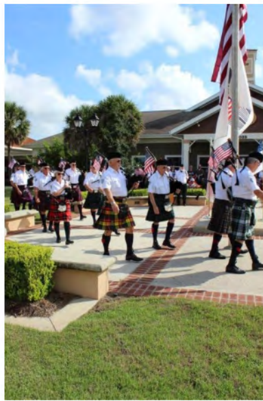
The Villages Sounds of Scotland Bagpipers