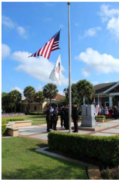
The Villages Honor Guard