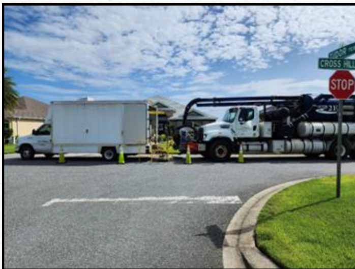
Pictured are the CCTV truck (left) and sewer cleaning truck to the right.

The safety of residents and our personnel is of the utmost importance. If you see signs indicating this activity or trucks such as those pictured below, please exercise caution.