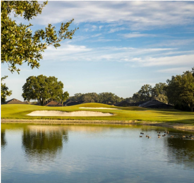
Amberwood Executive Golf Course

The Villages® Community Development Districts